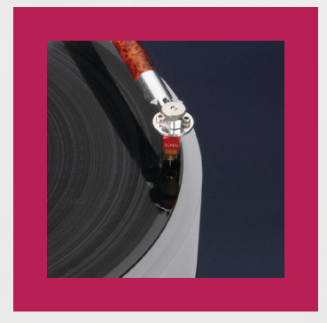
MC Scheu Kupfer L