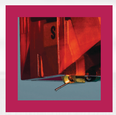
MC Scheu SL