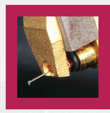
MC Scheu Ruby 3